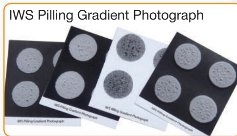
IWS Pilling Gradient Photograph

*Technical Data Subject to change without notice.