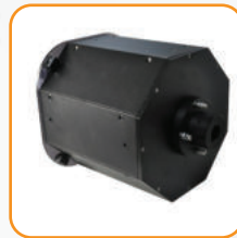
M&S Pilling & Snagging Drum