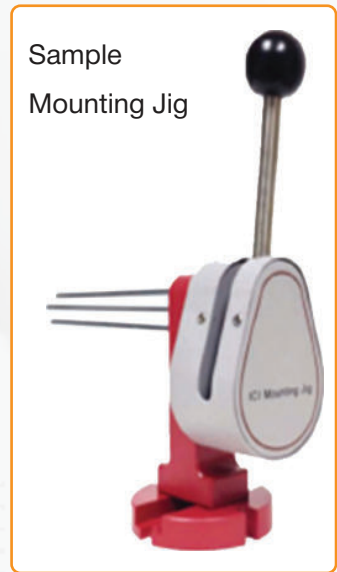
Sample Mounting Jig