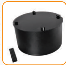
BS8479 Octagonal Snagging Drum