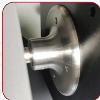
Box connecting flange